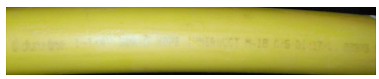
Figure 2: Print Line of Exhumed Conduit