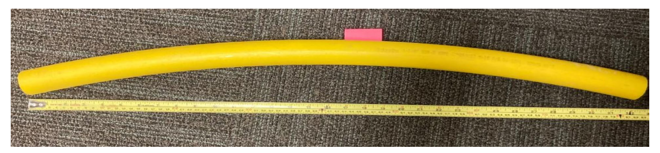
Figure 1: Sample of Exhumed Conduit