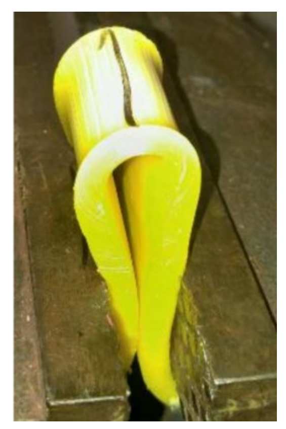
Figure 4: Image of Bend-Back Specimen Showing Inner Surface